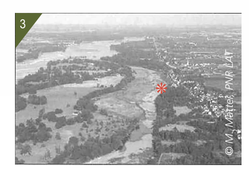
3. Aerial view of the intervention site (red marker).