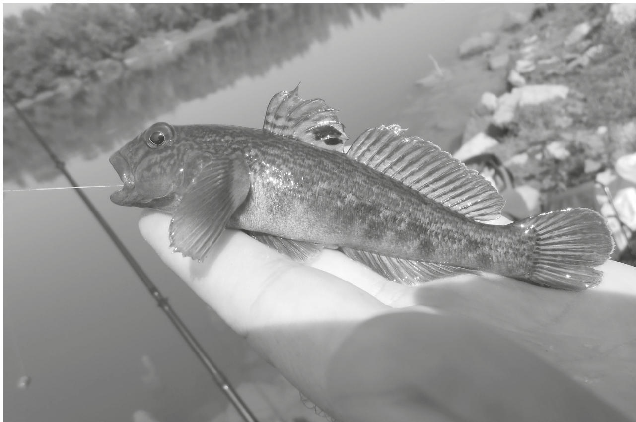
Fig. 3. Round goby Neogobius melanostomus from the Una River in Bosnia and Herzegovina (from Čolić et al. 2018; with the permission of Mr. Goran Šukalo).

Genus: Orsinigobius Gandolfi et al., 1986