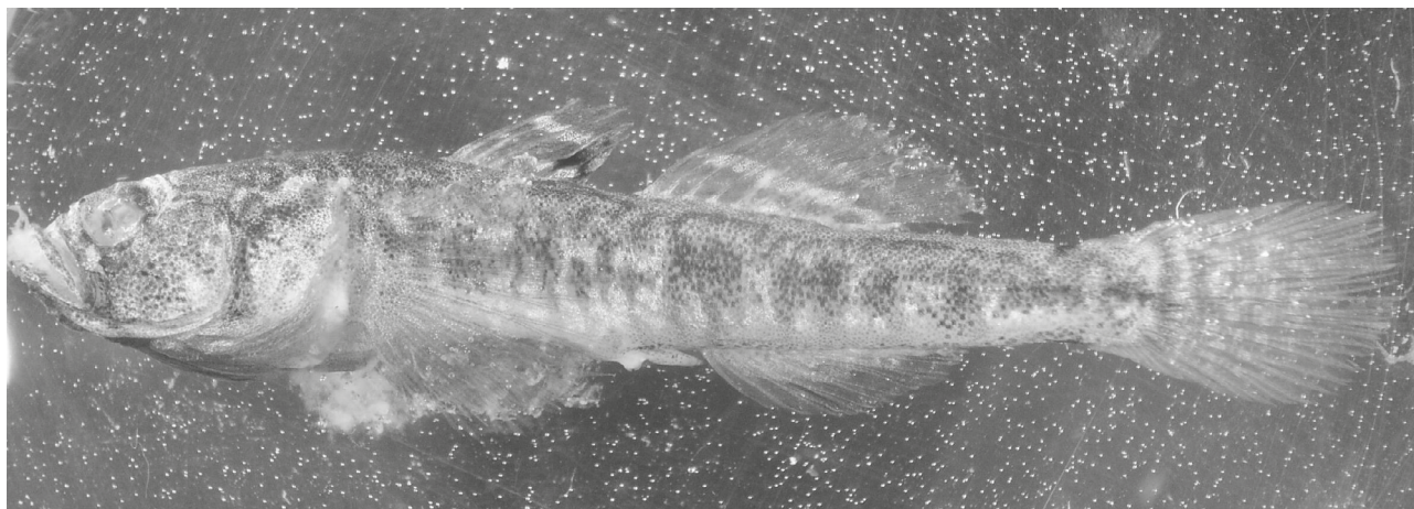
Fig. 2. Specimen from Hutovo Blato wetland, lower Neretva River catchment, firstly mentioned as unknown species (Ahnelt et al. 2009), but according to Šanda & Kovačić (2009) most probably Knipowitschia radovici.

Lake; Fig. 1). This species inhabits oligotrophic karst freshwaters in running and stagnant water, preferring silty habitats with sparse gravel and rocks (Šanda & Kovačić 2009, Tutman et al. 2013). It has been categorised as Vulnerable (VU; IUCN 2020), though it has not been assessed at the national level (Škrijelj et al. 2013).