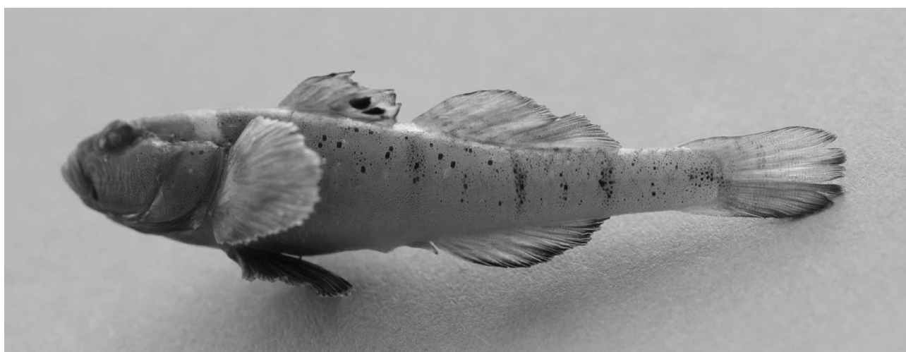
Fig. 5. Canestrini's goby Ninnigobius canestrinii (TL = 45.2 mm), caught on 25 May 2010 in the Hutovo Blato wetland, Bosnia and Herzegovina.

Pomatoschistus microps is a marine and brackish goby with a distribution extending to the eastern Atlantic, from Norway to Morocco, including