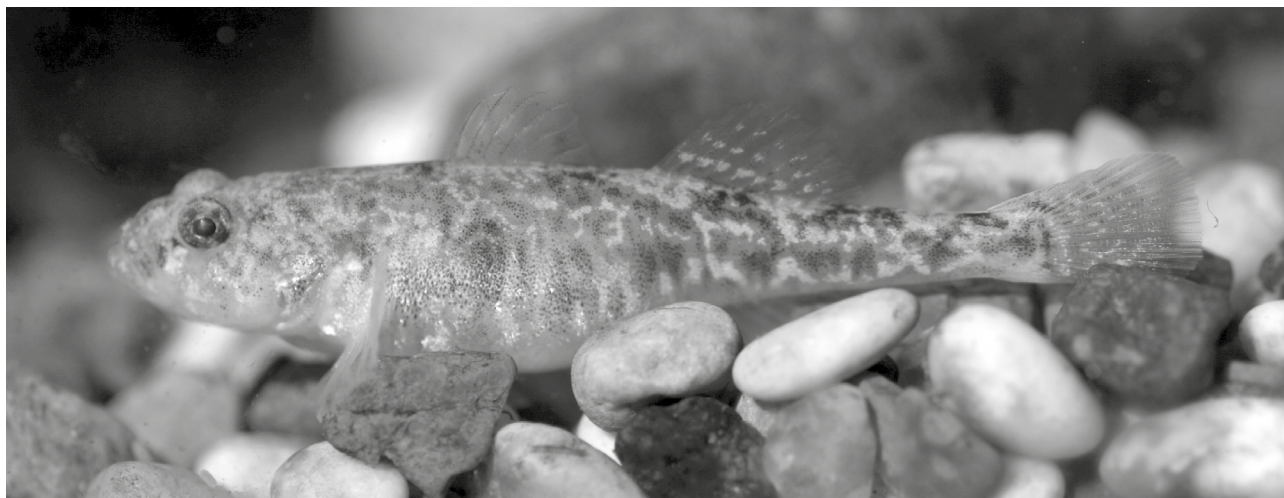
Fig. 4. Neretva dwarf goby Orsinigobius croaticus (TL = 41.7 mm), lower course of the Neretva River, Bosnia and Herzegovina.