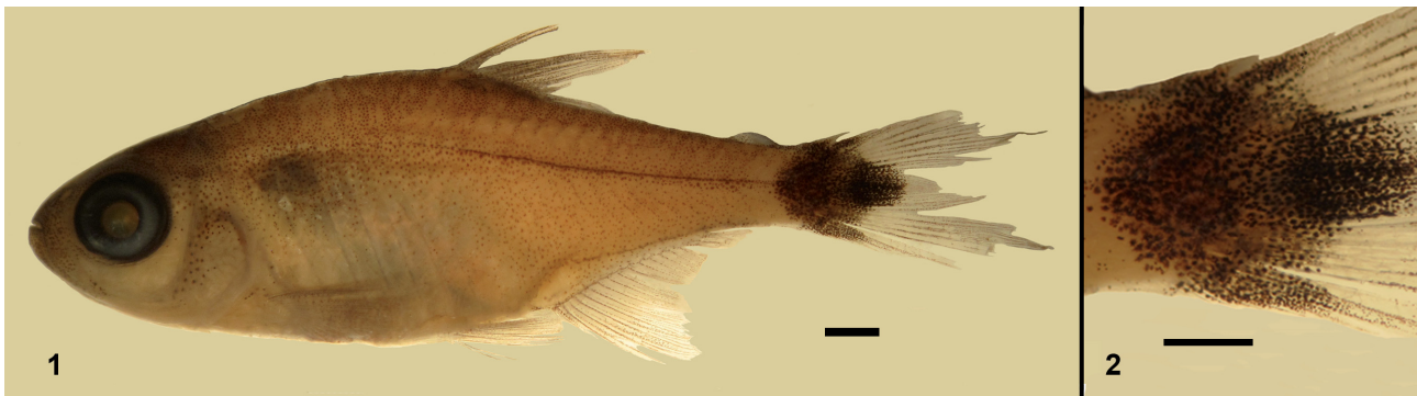
Figs 1-2. (1) Hemigrammus tridens , MHNG 2678.025, 17.3 mm SL, male. (2) Detail of the caudal spot. Scale bars = 1 mm.

Hemigrammus tridens was so far only known from several localities in the Paraguay River basin. The specimens examined belong to three collecting sites of the Paraná River basin, downstream from its confluence