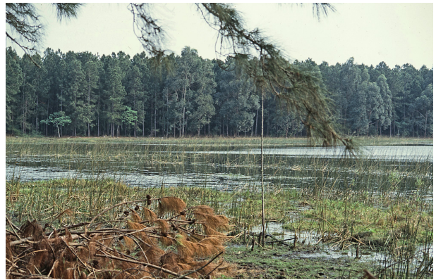
Fig. 6. Permanent lake close to San Cosme (27°22'34"S-58°23'47"W), RN 12, km 1072, Depto. San Cosme, Corrientes, Argentina.

Eigenmann & Ogle (1907) described Hemigrammus tridens based on two specimens, designated “Type” and “Cotype”, from the Pypucú stream in Paraguay, being then deposited both at the Indiana University collection (IU 11262). These specimens are today housed at the California Academy of Sciences in the lots CAS 58609 (holotype) and CAS 61474 (paratype). This type status is supported by the article 72.4.6 of the International Code of Zoological Nomenclature (1999). A decade