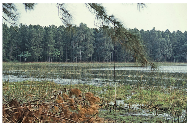
Fig. 6. Permanent lake close to San Cosme (27°22'34"S-58°23'47"W), RN 12, km 1072, Depto. San Cosme, Corrientes, Argentina.

with the Paraguay River (Fig. 5). Güyraugua river is a tributary of Monday river in the country Paraguay. Puerto Tirol is located on the coast of Paraná River in Argentina. The environment in which H. tridens was collected close to San Cosme is a permanent lake, more than 1 m deep, with profuse vegetation and abundant wood on substrate (Fig. 6). In this habitat the following species were found: Aphyocharax nattereri , Hyphessobrycon elachys , H. eques , H. igneus , H.luetkenii , Moenkhausia dichroua , Serrapinnus calliurus , Pyrrhulina australis , Apistogramma borellii , Cichlasoma dimerus , and Laetacara dorsigera (captured in December 1994 and/or September 1995).