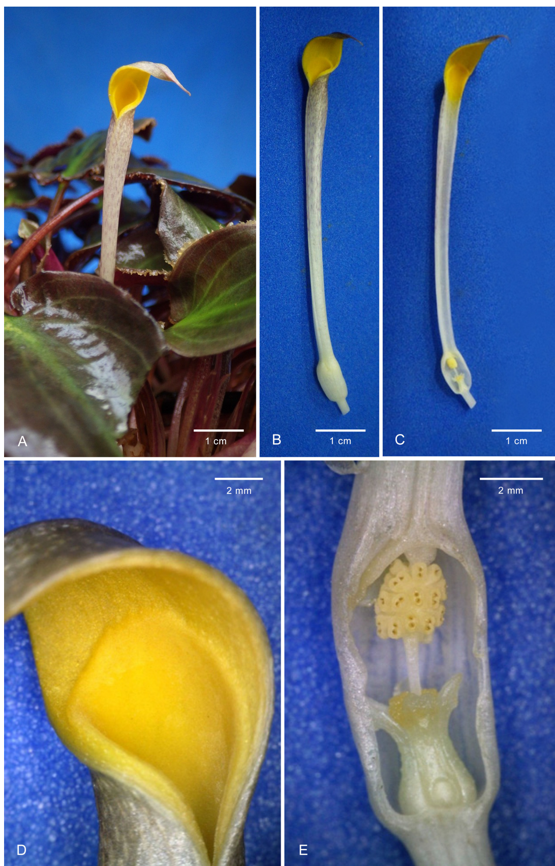
Fig. 5. Cryptocoryne aura – A: plant showing limb of spathe slightly subobliquely twisted (older spathe); B: limb of spathe bent forward at a younger stage than in A; C: spathe longitudinally cut open showing kettle in lower part; D: limb of spathe showing slightly raised collar; E: opened kettle showing female flowers below, olfactory bodies (yellow) above, sterile interstice, and male flowers above. – Photographs by S. Wongso.