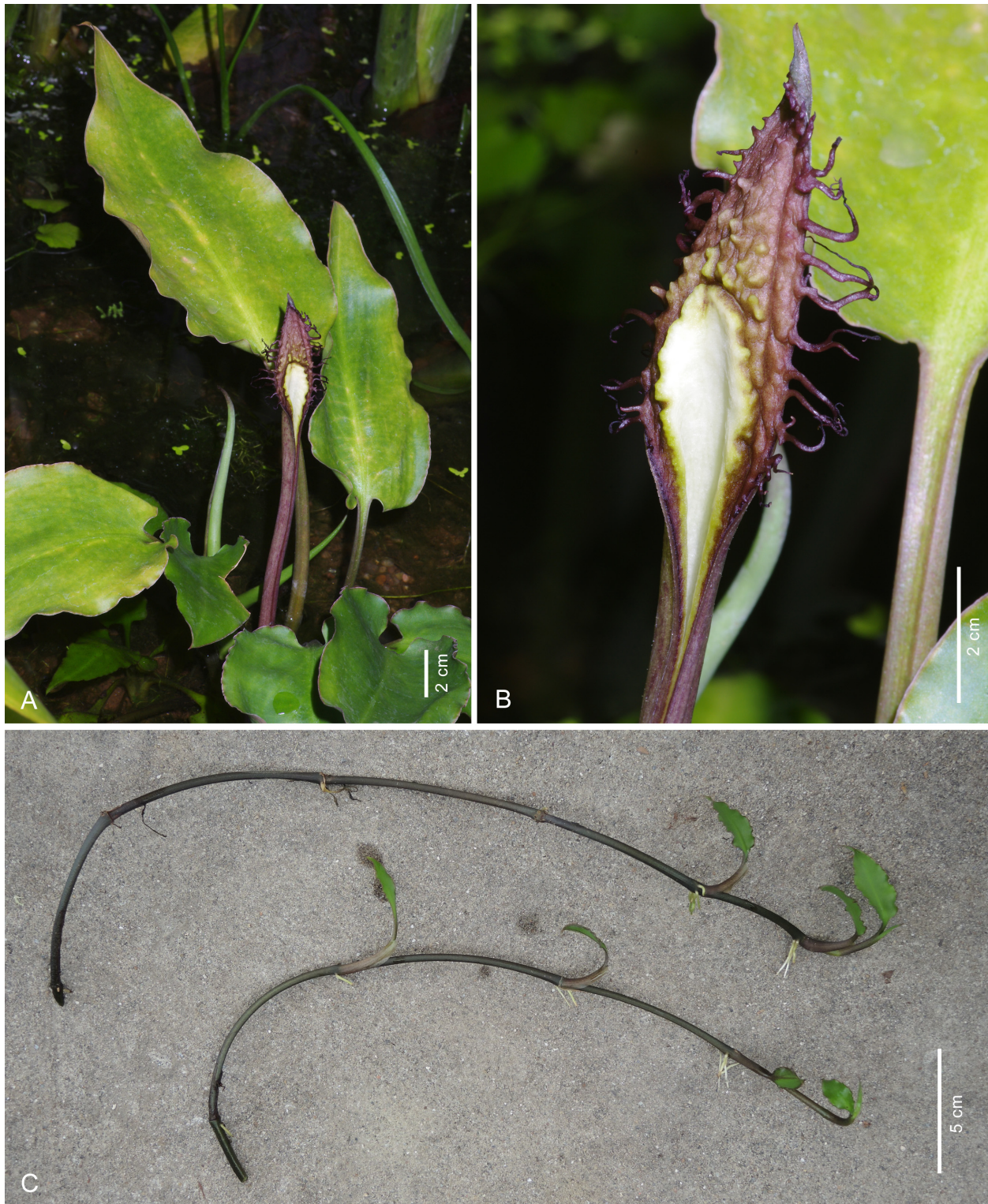
Fig. 3. Cryptocoryne ciliata var. bogneri – A: cultivated plant; B: spathe limb showing whitish tube opening, somewhat rough purplish limb surface and mostly unbranched marginal cilia; C: stolons. – Source: J. Bogner 3025 . – Photographs: A & B by G. Gerlach; C by N. Jacobsen.

Cryptocoryne ciliata var. bogneri N. Jacobsen, var. nov. – Fig. 3 & 4.