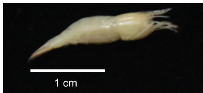
Figure 5. Caridina serratiostris .

Caridina serratiostris is a freshwater shrimp found in settlement areas and monoculture forest. The morphological character of this shrimp is that there are 5 teeth located behind the eyes, at the tip of the rostrum to the end of the scapocerite. The teeth on the rostrum are spread evenly and the rostrum is flat. Has black, orange, blue and red elements in its body parts.