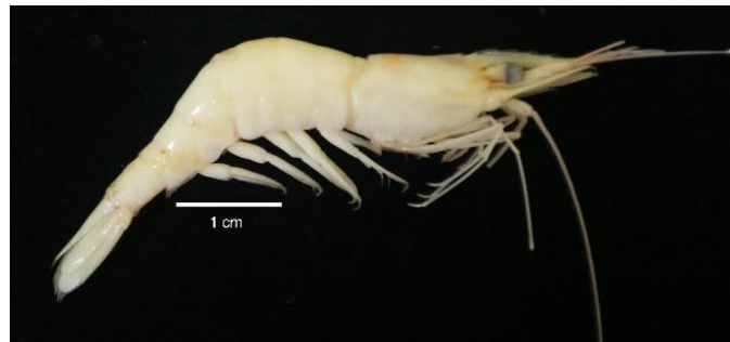
Figure 4. Palaemon carcinus .

Caridina serratiostris is a freshwater shrimp found in settlement areas and monoculture forest. The morphological character of this shrimp is that there are 5 teeth located behind the eyes, at the tip of the rostrum to the end of the scapocerite. The teeth on the rostrum are spread evenly and the rostrum is flat. Has black, orange, blue and red elements in its body parts.