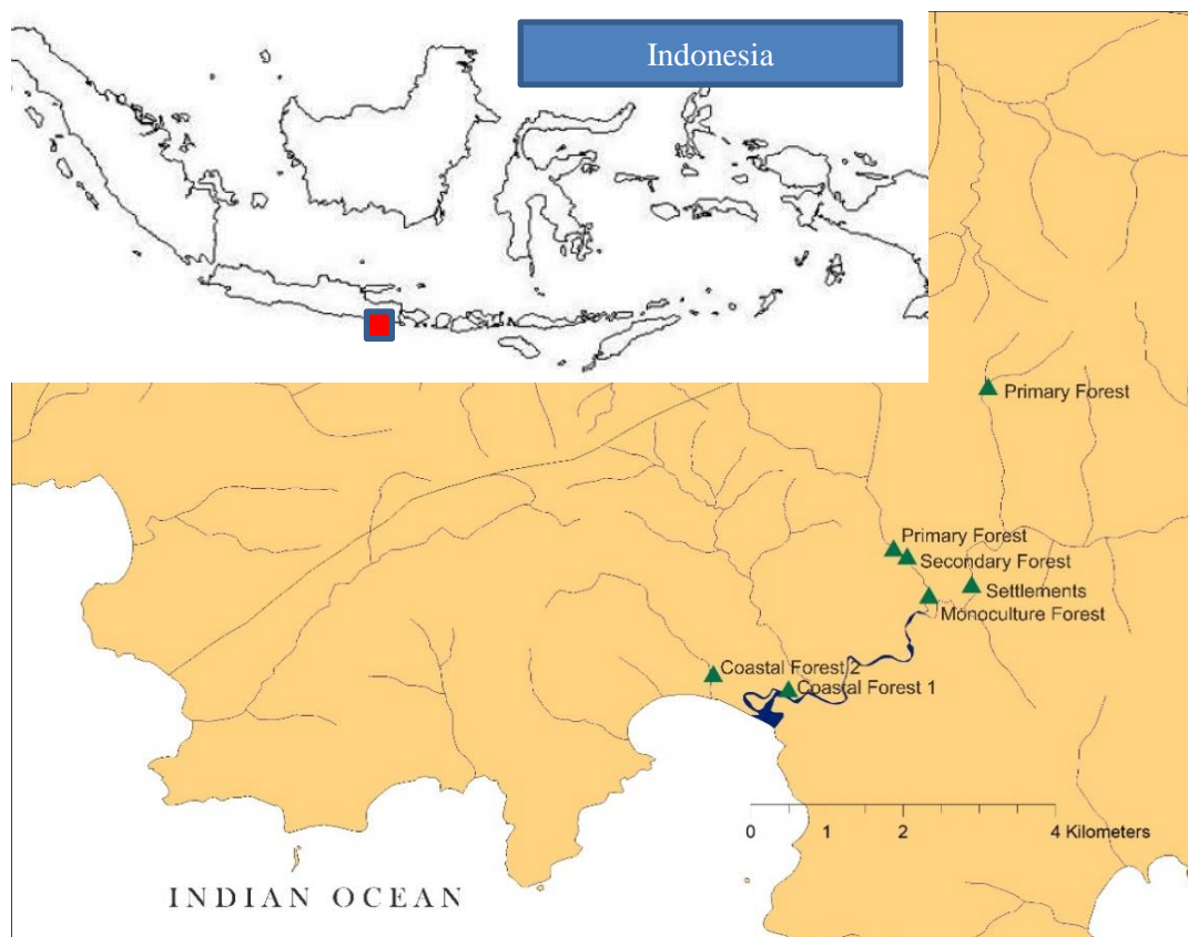
Figure 1. The point of sampling location at the Bandalit Resort.

its body size, there are interior orbital shapes in the lower part of the carapace eye, number of rostrum teeth, second pereopod size, and the presence of preanal carina in the endopod section. Morphological characteristics at the species level of the genus Caridina are relatively small body size, the tip of the rostrum to the tip of the schapocerite, the rostrum teeth are spread evenly, the shape of the rostrum is flat. The remaining doubtful species of freshwater shrimps were taken to LIPI Cibinong Bogor for re-identification.