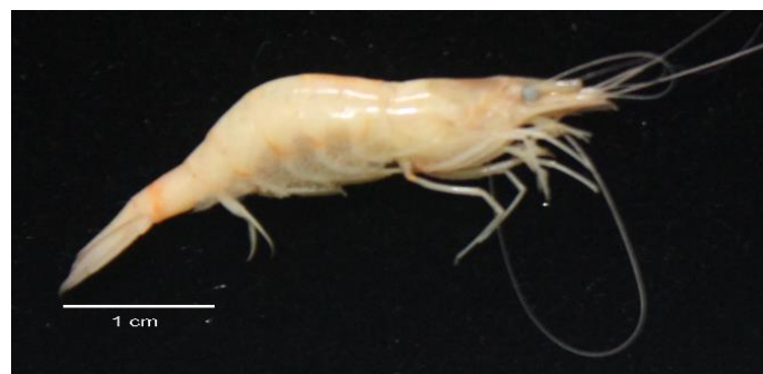
Figure 6. Caridina brachydactyla .

Caridina brachydactyla is a type of freshwater shrimp that can be found in settlement areas, monoculture forests, secondary forests and primary forests 1. The morphological characters of this freshwater shrimp are a long and oval shape of rostrum. There are more than 12 dorsal teeth and 3 rostrum teeth in the back of the eye on its rostrum. It also have thorn at the preanal carina.