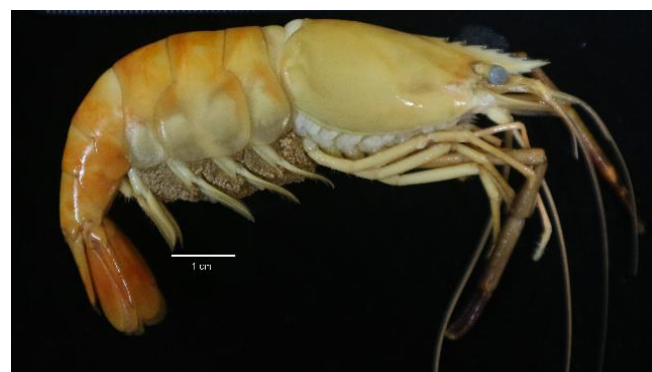
Figure 3. Macrobrachium lar .

Macrobrachium lar is a type of freshwater shrimp found in primary forest area 2, found on rocks type habitat a muddy and sandy substrate. Macrobrachium lar has morphological characters, such as a rounded orbital interior shape and ocular beak. This shrimp epistome and thoracic sternite are round shaped. Abdominal pleuron is slippery, whereas females do not have slippery abdominal sternite. Having a thin shaped and tall preanal carina, both periopod have the same size and shape. Macrobrachium lar , have two large and tenuous thorn on its upper and lower rostrum, the end of the rostrum does not reach the upper third segment of the pedalcle nor the end of the scapocerite.