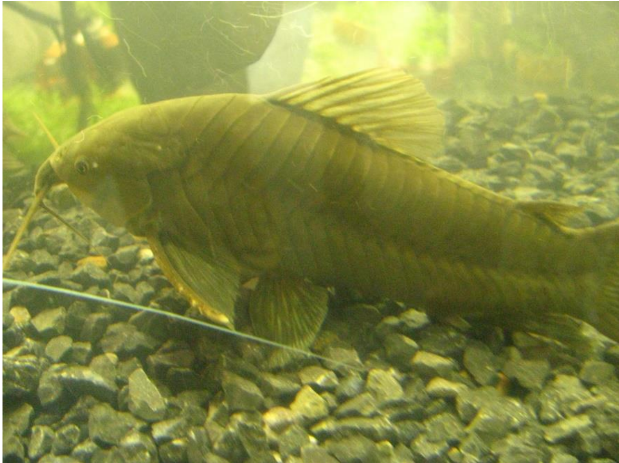
Fig. 1. Cascadu, Hoplosternum littorale .