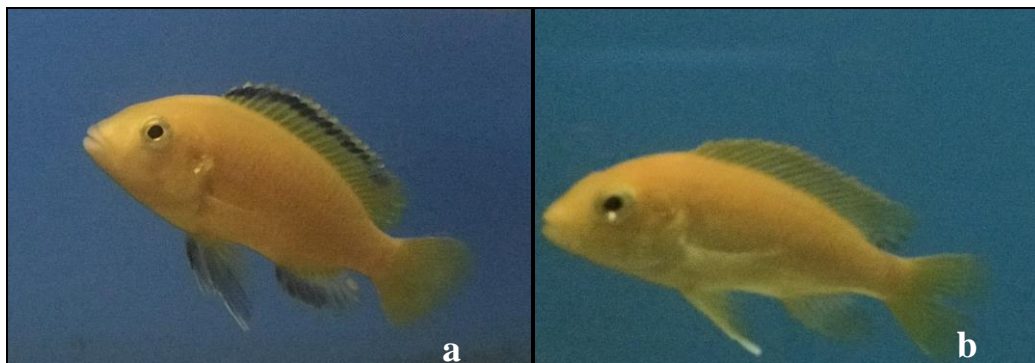
Figure 1. Male (a) and female (b) electric yellow cichlid ( Labidochromis caeruleus ) (Original)

In this study, effects of 17\alpha -Metilttestosteron and 17\beta -Estradiol hormones on growth, development, survival rate, sex reversal and color parameters of cichlid fish ( Labidochromis caeruleus Fryer, 1956) were investigated ( Figure 1 ).