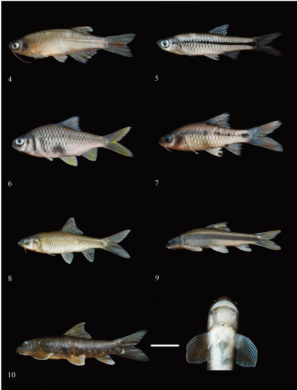
Figures 4–10. Freshwater fish in Cyber Stream, outside Huai Kha Khaeng Wildlife Sanctuary, West Thailand. Figure 4. Danio albolineatus , 31 mm SL. Figure 5. Rasbora paviana , 51 mm SL. Figure 6. Mystacoleucus marginatus , 63 mm SL. Figure . Puntius rhombeus , 25 mm SL. Figure 8. Neolissochilus stracheyi , 78 mm SL. Figure 9. Garra cambodgiensis , 38 mm SL. Figure 10. Garra nasuta , 73 mm SL and mouth of Garra nasuta .