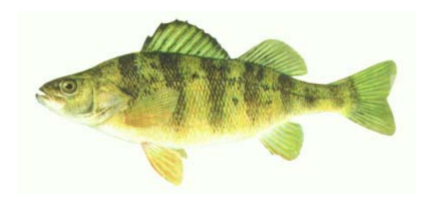
Perca flavescens , yellow perch.

Skeletons of the yellow perch, Perca flavescens , have been found in 12,000 to 10,000 year old fossil sites in North Dakota indicating that they lived in North Dakota at the end of the last Ice Age. They still live in North Dakota today. Yellow perch grow to lengths of about 10 inches. Yellow perch are today widespread in North America and live in fresh water lakes, ponds, and quiet rivers. They feed on insects, larger invertebrates, and other fish.