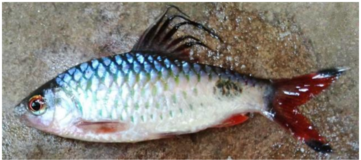
Photo: S. Sajan. Licensed under Creative Commons (CC BY 3.0). Available: https://commons.wikimedia.org/w/index.php?curid=31179931. (July 2019).

U.S. Fish and Wildlife Service, February 2011 Revised, July 2018, July 2019 Web Version, 7/10/2019