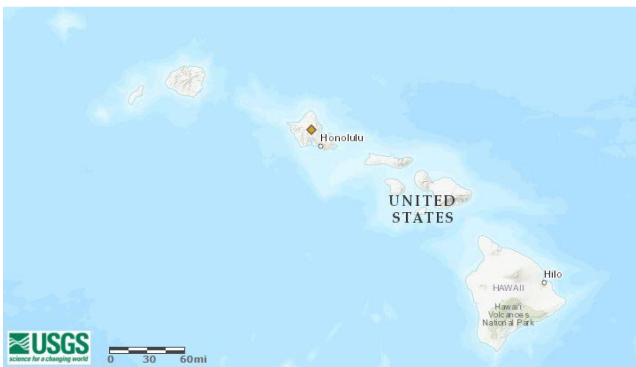
Figure 2 . Map showing approximate location of Dawkinsia filamentosa collected from Oahu, Hawaii in 1984. Population is extirpated and was not a source location for climate matching. Map from Nico et al. (2019).