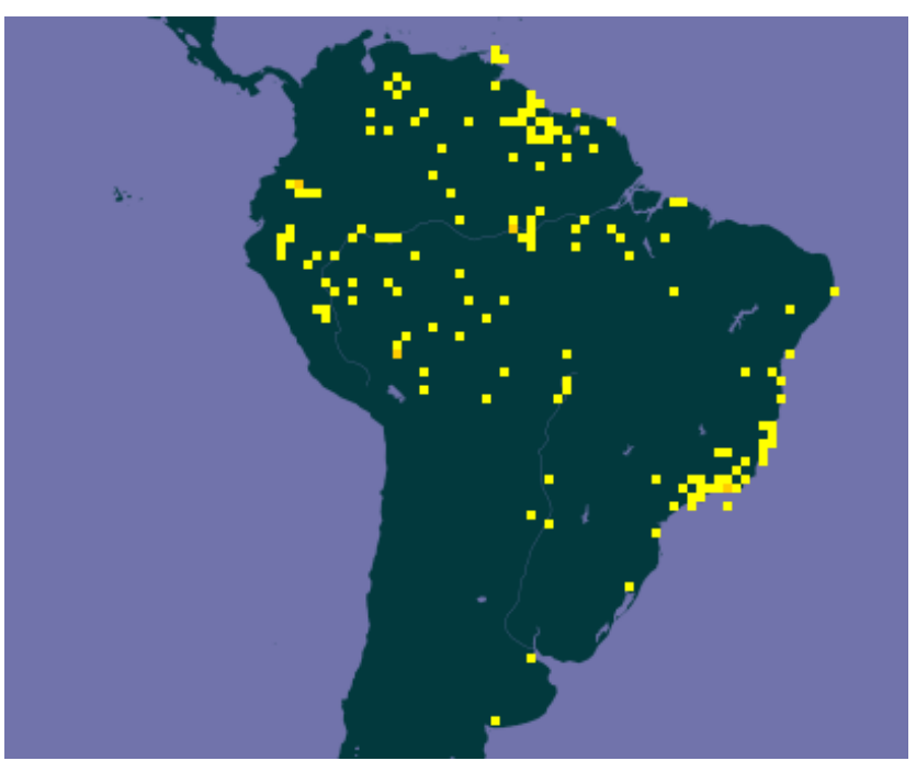
Figure 1. Known global distribution of C. callichthys . Map from GBIF (2016). The southernmost point on the map and two points in North America (unpictured) were excluded from climate matching because they do not represent current established populations.