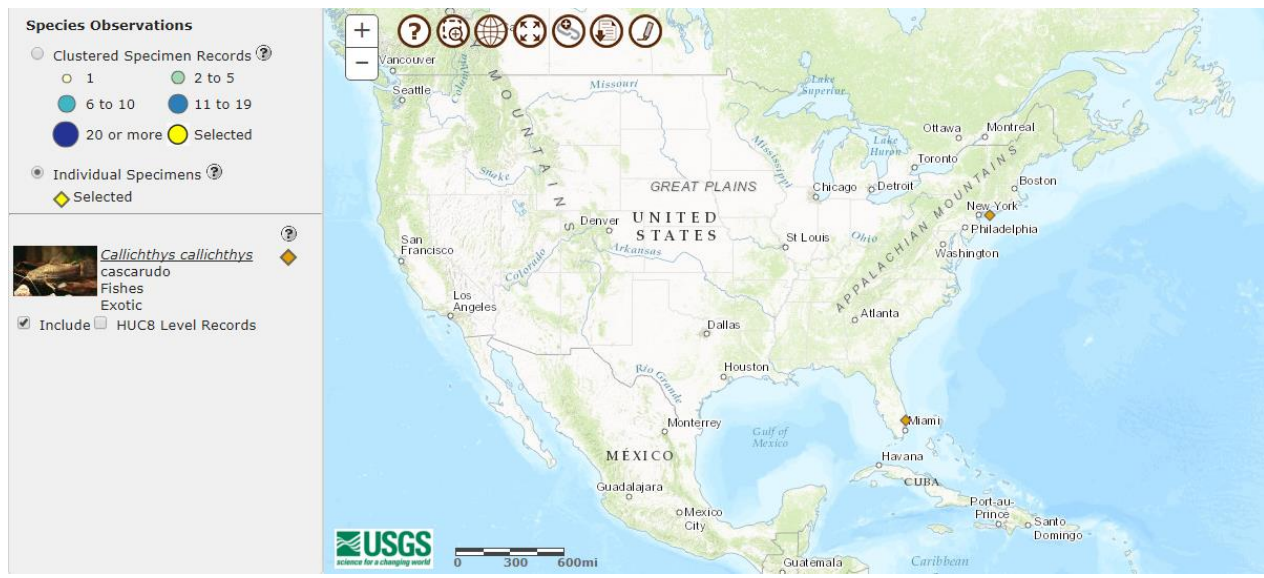
Figure 2. Known records of C. callichthys in the U.S. None of the records represent established populations. Map from Nico (2017).