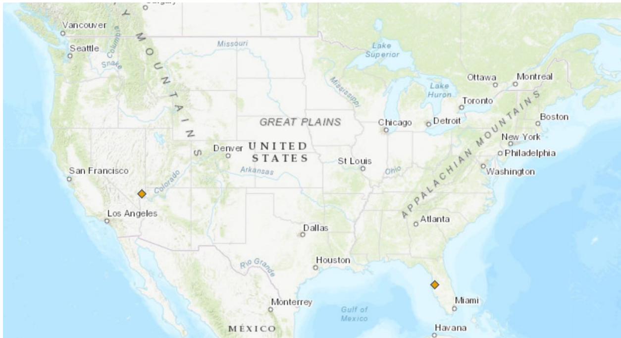
Figure 2. Known distribution of Melanochromis auratus in the United States in Nevada and Florida. Map from Nico (2019). Locations do not represent established populations and will not be used in the climate match.