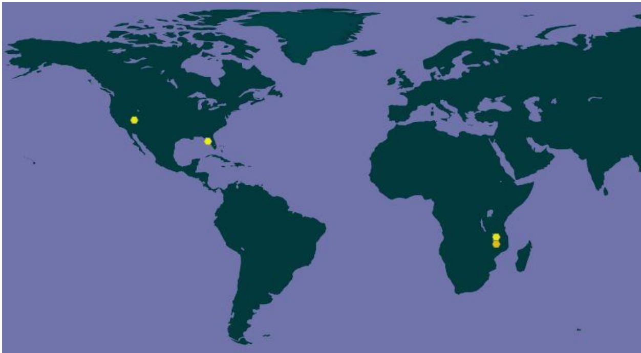
Figure 1. Known global distribution of Melanochromis auratus . Observations are reported from southeastern Africa and North America. Map from GBIF Secretariat (2019). Locations in the United States do not represent established populations and will not be used to select source locations in the climate match. No georeferenced points were available for Israel, since that is not a self-sustaining population any points would not have been used to select source locations for the climate match.