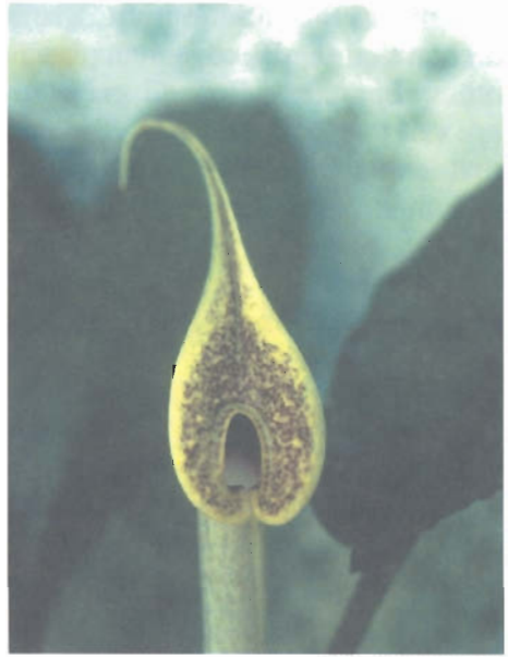
1b. Limb of the spathe of Cryptocoryne xtimahensis .