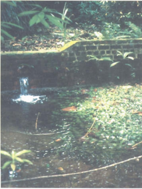
1a. Dammed pools on the Jungle Fall Stream in the Bukit Timah Nature Reserve, Singapore.