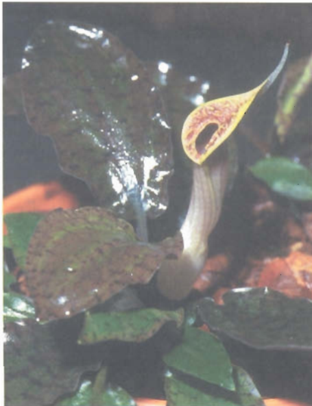
1c. Cultivated plant of Cryptocoryne xtimahensis .