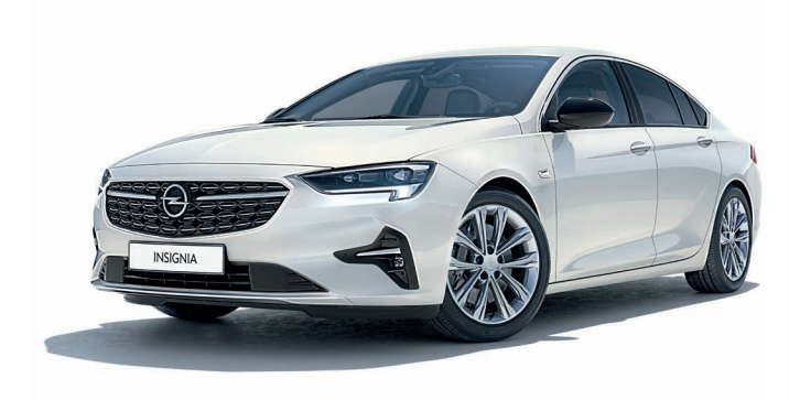
Summit White Brilliant paint*