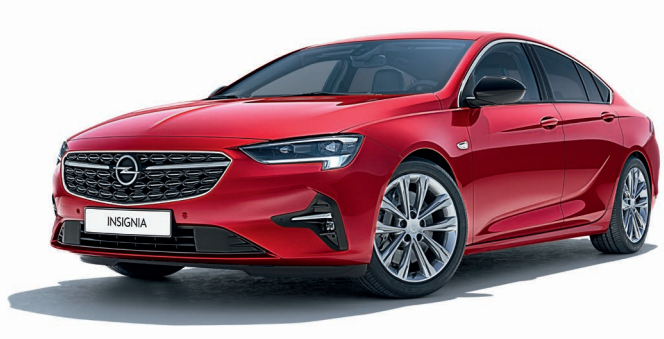
Hot Red Premium paint*

E&OE April 2021. Images shown for illustration purposes only. Please discuss colours available with your local Opel Dealer. *Premium, Metallic and Brilliant paint optional at extra cost. Due to the limitations of the printing process, the colours reproduced may vary slightly from the actual paint colour and trim material. As a result, they should be used as a guide only. Your Opel dealer has a comprehensive display of paint finishes.