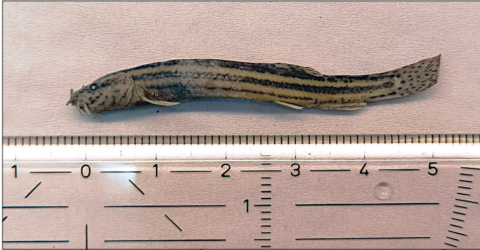
Fig. 3: Misgurnus fossilis (NHMW 100424), individual analysed. – Abb. 3: Untersuchtes Exemplar von Misgurnus fossilis (NHMW 100424).

Here we report the most recent finding of a M. fossilis individual in Vienna as well as the first detection of the species via environmental DNA (eDNA) from a water sample from “Schwarzes Loch”, a small pond within the Lobau, Vienna, Austria (Fig. 2).