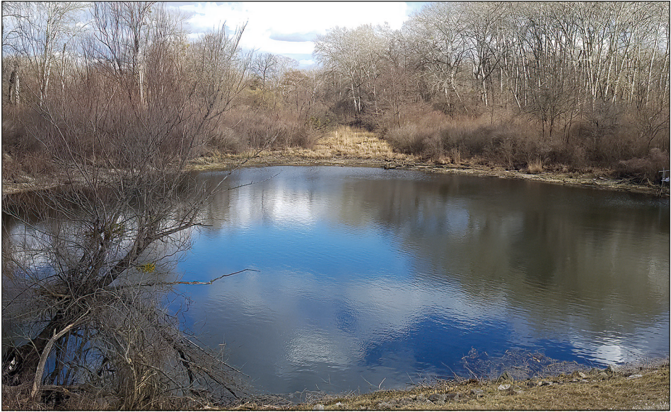
Fig. 2: A. Schwarzes Loch, Lobau, 1220 Vienna, Austria. Photo: NHMW. B. Location of Schwarzes Loch in the Lower Lobau. © OpenStreetMap. – Abb. 2: A. Schwarzes Loch, Lobau, Wien, Österreich. Foto: NHMW. B. Position des Schwarzen Loches in der Unteren Lobau. © OpenStreetMap.