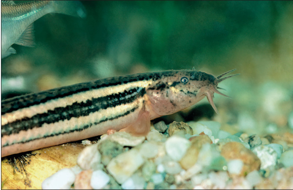
Fig. 1: Misgurnus fossilis . – Abb. 1: Misgurnus fossilis .

tion to the Danube River (Spindler 1997; Zauner et al. 2006). For Vienna, the evidence (all from Lobau) is quite sporadic and recorded in the literature since the 1980s, the last