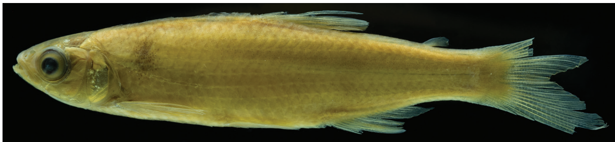
Figure 5. Holotype of Aphyocharax avary : ANSP 39217, 41.7 mm SL.