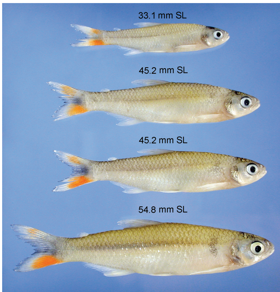
Figure 3. Recently preserved specimens of Aphyocharax pusillus : ANSP 178013, 4, 33.1–54.8 mm SL, Peru, Loreto, Rio Napo (Amazon river basin), right bank just upstream from mouth of Mazan river, near town of Mazan (3°29'10"S, 73°6'24"W).

slightly convex from this point to anal-fin origin; straight and posterodorsally-aligned along anal-fin base; postventral profile slightly concave from base of last anal-fin ray to end of caudal peduncle. Snout rounded. Mouth terminal, Lower jaw protrudes slightly beyond upper jaw when mouth closed; aligned approximately to middle of eye. Long and truncated snout, with its length larger than orbital diameter. Mouth terminal; upper jaw slightly larger than lower one. Maxillary bone surpassing a vertical line through middle of the eye; maxillary teeth small and conical, spread along proximal half of the bone. Lateral line interrupted; last scale on caudal-fin base.