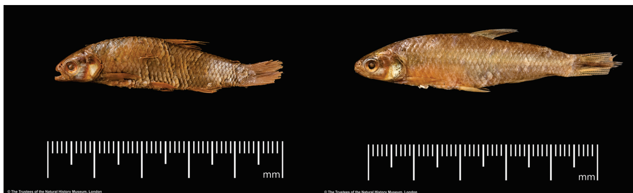
Figure 1. Syntypes of Aphyocharax pusillus : BMNH 1867.6.13.58-59.