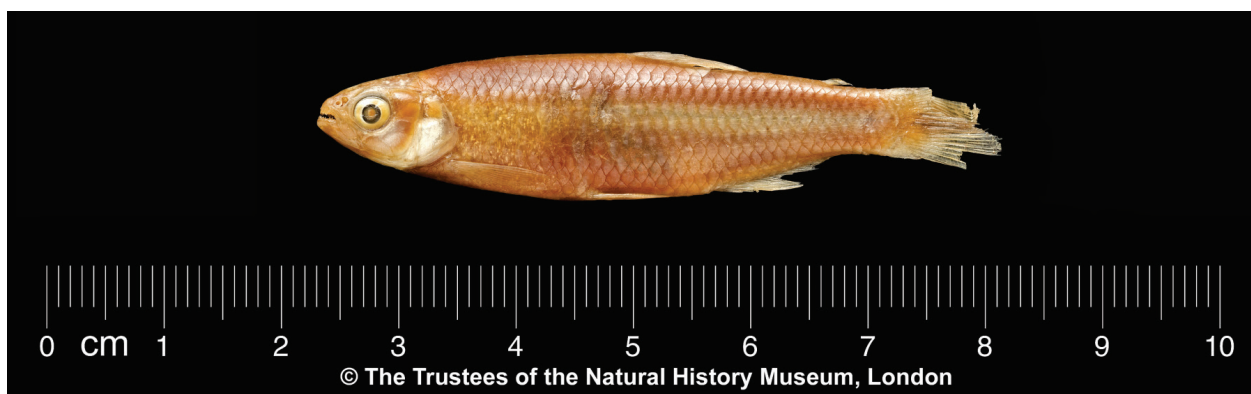
Figure 2. Lectotype of Aphyocharax alburnus : BMNH 1869.5.21.10.